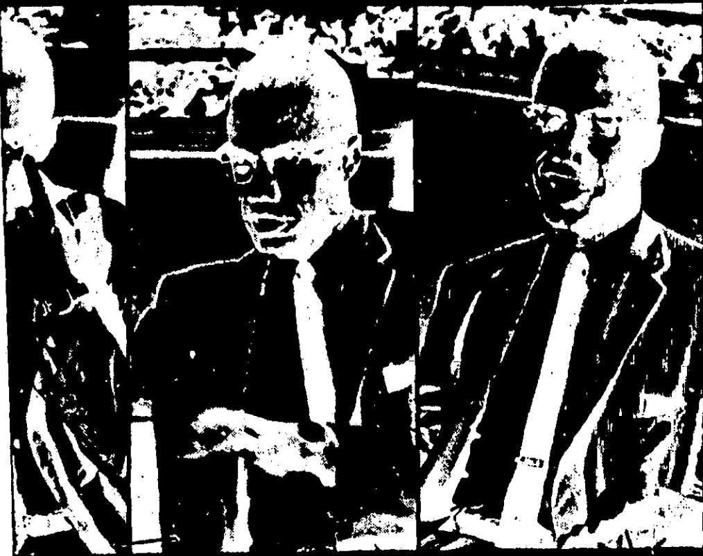
(Always Cite in Source Below)